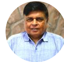
Dr. Sanjay Gupta