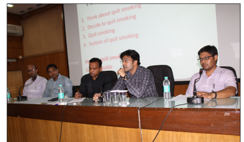
Students engaged in panel discussion during WNTD

emphasizing the ill effects of the chewing tobacco as a leading cause for oral cancer and throat cancers. The event proceeded with a panel discussion on the topic, which extensively dealt and elaborated the harmful effects caused by tobacco consumption, both in chewable and in smoking form. The difficulties in banning the cultivation of tobacco crop and new treatment and rehabilitative alternatives were discussed. The event sensitized the audience towards quitting smoking, adopting a healthy lifestyle like exercising daily for 30 minutes and encouraged them to prohibit using the same within the Institute campus. In the end, the panelists displayed various slogans to the audience. The event concluded with the address of the Director who emphasized the policy decisions taken by the Institute towards a tobacco free NIHFV.