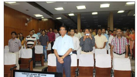
Staff taking an oath during World Environment Day

Different messages were displayed and the audience was encouraged to reduce plastic pollution. An oath was taken at the end of the event by the staff pledging that, “together we can ensure that our future generation lives in a clean and green planet, in harmony with nature”. The celebrations concluded by planting trees in the campus by the Director and other faculty members.