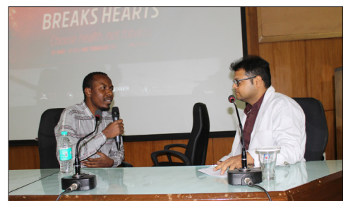
A play by PGDPHM students during WNTD